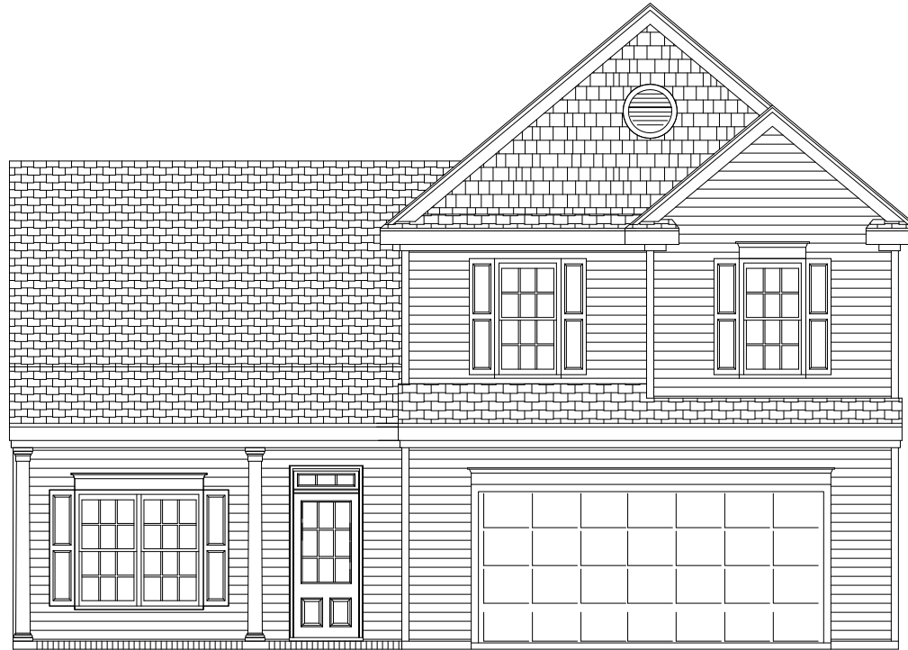
THE "MARQUIS"-A 41'-0" WIDE BY 48'-0" DEEP